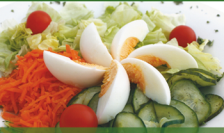
WITH ONE BOILED EGG MIXED SALAD