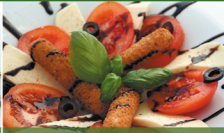
WITH FRIED STICKS OF MOZZARELLA BELLA MOZZARELLA 1